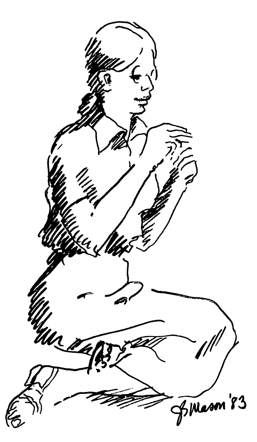
Our resident signer.